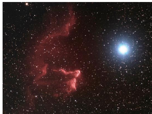
IC 59 and Navi, Happy Halloween!