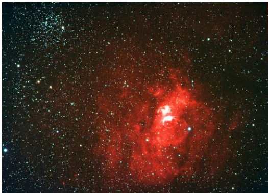
M52 and Bubble Nebula